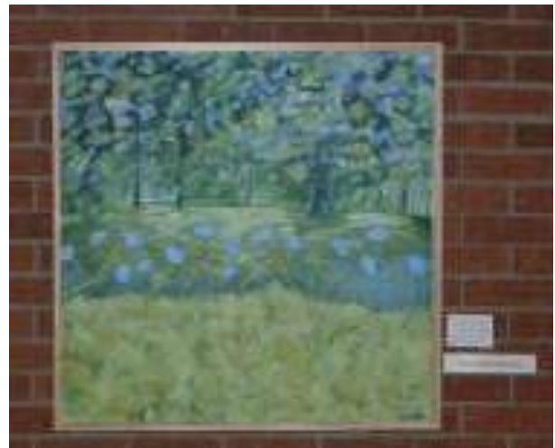
Erchless Gardens - Acrylic